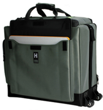
Back pocket for setup board